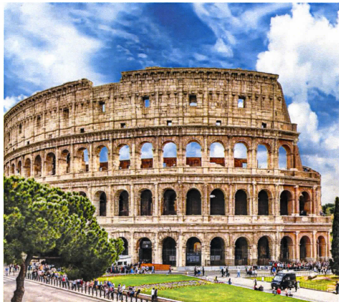
The Colosseum - Rome

Another free day to explore the wonders of Rome. You may choose to relax at a sidewalk café or people-watch around the famed Spanish Steps. (B)