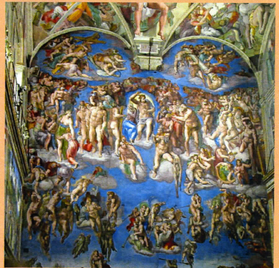
Sistine Chapel – Michelangelo's "Last Judgment"