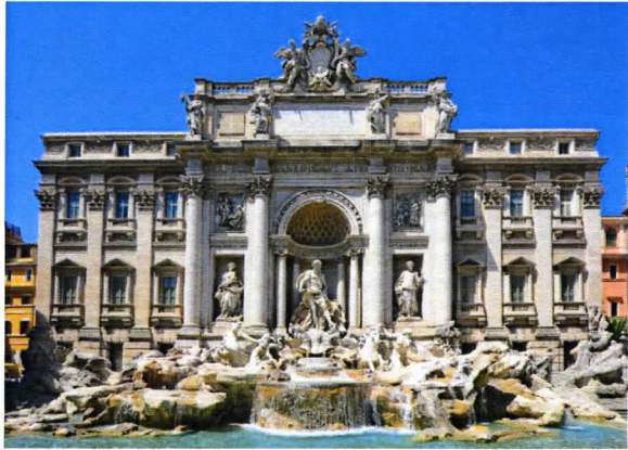
Trevi Fountain - Rome