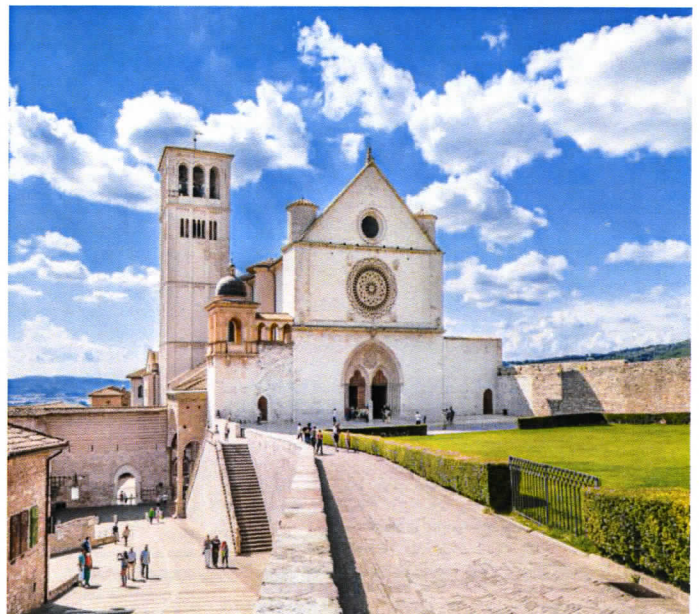
Basilica of St. Francis - Assisi