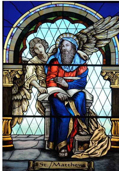
St. Matthew, Patron Saint Pray for Us.

Christ came for all. Not some but all. He gave us a mission of love. Love of God and love of neighbor. We are His hearts and bearers of His hope along this journey. Our doors are open for all to feel welcomed, loved and forgiven. And when we go out through our doors, we are the sisters and brothers of His Good News.